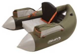
Fish Cat 4 - LCS