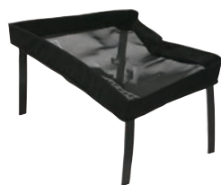
LCS Stripping Apron