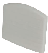
1 - Foam Seat Back Block (18" x 27" x 2")