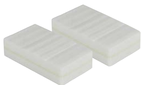
2 - Foam Seat Bottom Blocks (18" x 10" x 4" each)