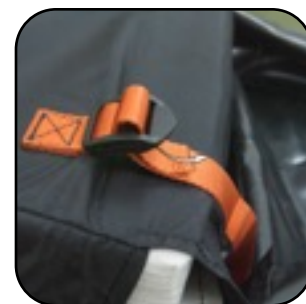
Ladder Lock Detail