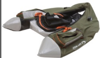
Fish Cat 4 - LCS